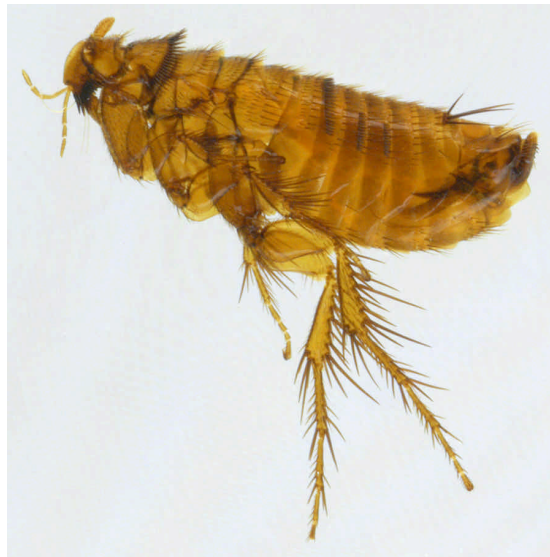
Mole flea Hystrihopsylla talpae talpae

Hystrihopsylla talpae talpae Mole flea 16/3/04, Upper Bucklebury, SU542683, large male flea from nest in plastic compost bin collected 29 Feb 04. Very large blind flea with well-developed genal and pronotal comb, and further combs on TII, TIII, TIV. [MWS]