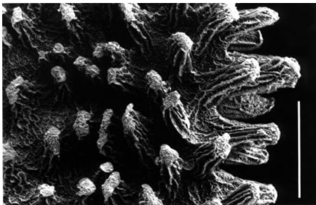
Figure 3. Ultrastructure of the wing surface and margin reveals unique features never found in any other mayfly species. The presence of these upright scales certainly plays a hydrofugous role and enables the wing to remain waterproof. Scale bar, 10 \mu m.