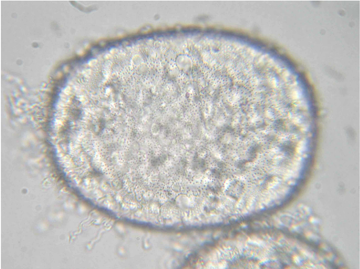
Figure 2 E. lateralis concii (Grandi, 1953) stat. nov. from Switzerland, near the Lac Léman (coll. A. Wagner: fullgrown nymph). Numerous KCTs are visible, several of them are uncoiled.

Figure 2. Œuf d' E. lateralis concii (Grandi, 1953) stat. nov. de Suisse, près du Lac Léman (coll. A. Wagner : larve en fin croissance). De nombreux KCTs sont visibles, plusieurs d'entre eux sont déroulés.