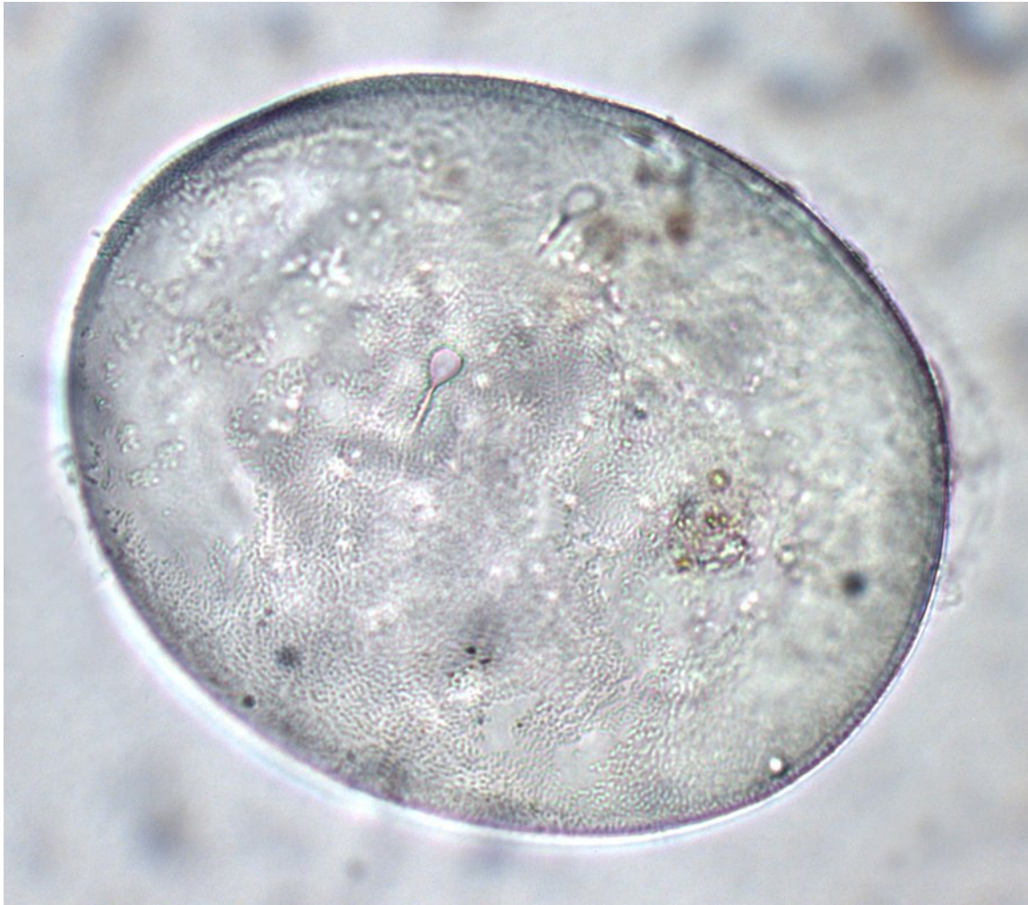
Figure 3. Egg of Electrogena lateralis lateralis (Curtis, 1834) from Germany (Eifel-mountains: fullgrown nymph). No KCTs are visible. The surface is totally smooth.